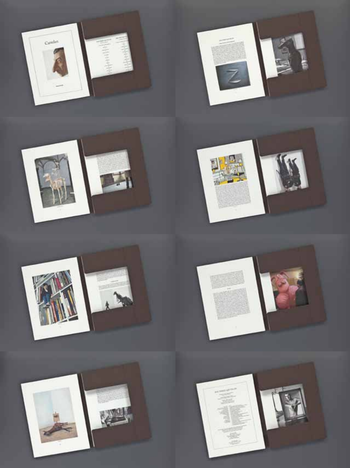
Sample pages of "The Three Cattelan" Concept and editing: Maurizio Cattelan Essay: Francesco Bonami